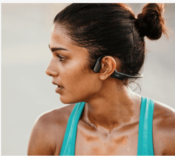
Great for Sports & Exercise

Bone conduction transmits sound through vibrations on the bones around your ear, not directly through the air in your ear canal. They are ideal for those with hearing sensitivities or eardrum damage, and because they don't fully block out ambient noise, bone conduction headphones are great for a variety of activities.