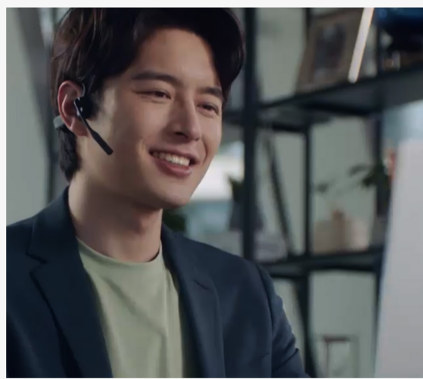
Perfect for Work