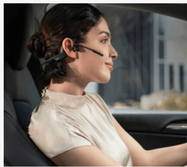
Safely use for Commuting