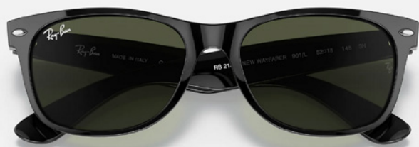
RAY-BAN ORIGINAL WAYFARER CLASSIC SUNGLASSES