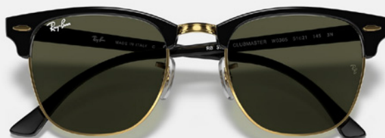
RAY-BAN CLUBMASTER CLASSIC SUNGLASSES