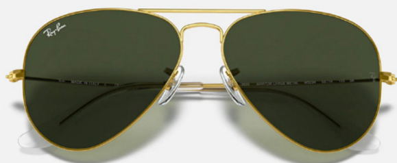
RAY-BAN ORIGINAL AVIATOR SUNGLASSES

Never just a transient trend, Ray-Ban eyewear marks out the wearer as an individual of taste.