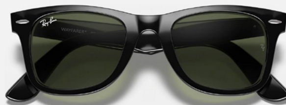
RAY-BAN NEW WAYFARER CLASSIC SUNGLASSES