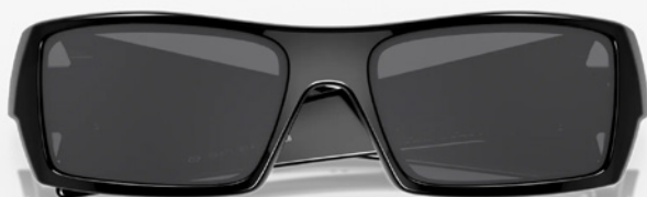
OAKLEY GASCAN SUNGLASSES 03-471