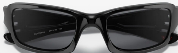
OAKLEY FIVES SQUARED SUNGLASSES 009238-04