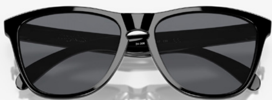
OAKLEY FROGSKINS SUNGLASSES 24-306

Oakley blends science and art to redefine product categories by rejecting the constraints of conventional ideas. The company is recognized as one of the most coveted brands in performance technology and fashion.