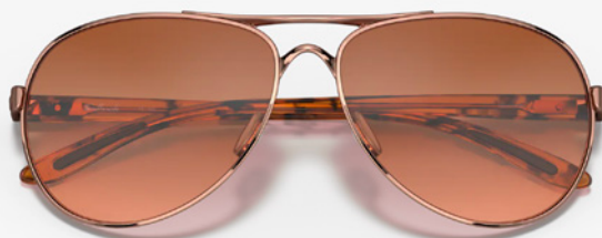
OAKLEY WOMEN'S FEEDBACK SUNGLASSES 004079-01